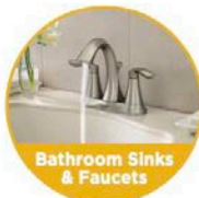
Bathroom Sinks & Faucets