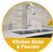
Kitchen Sinks & Faucets