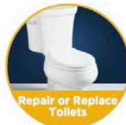
Repair or Replace Toilets