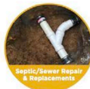
Septic/Sewer Repair & Replacements