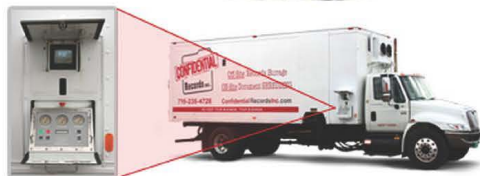
Monitor your document shredding through closed-circuit TV.

*Consult a tax advisor for advice on tax return retention. Do not destroy documents tied to pending litigation and never destroy any vital records such as wills, deeds, titles, birth or death certificates, etc.