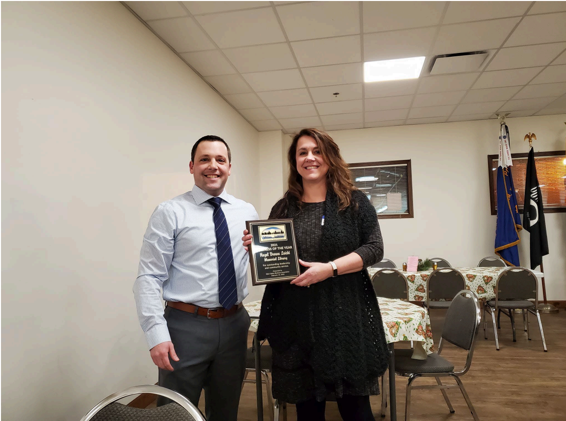
2021 Business of the Year