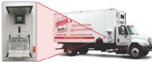
Monitor your document shredding through closed-circuit TV.

*Consult a tax advisor for advice on tax return retention. Do not destroy documents tied to pending litigation and never destroy any vital records such as wills, deeds, titles, birth or death certificates, etc.