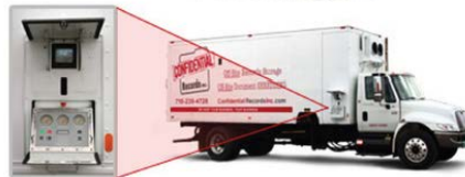
Monitor your document shredding through closed-circuit TV.

*Consult a tax advisor for advice on tax return retention. Do not destroy documents tied to pending litigation and never destroy any vital records such as wills, deeds, titles, birth or death certificates, etc.