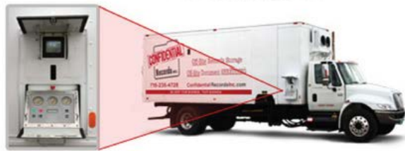
Monitor your document shredding through closed-circuit TV.

*Consult a tax advisor for advice on tax return retention. Do not destroy documents tied to pending litigation and never destroy any vital records such as wills, deeds, titles, birth or death certificates, etc.