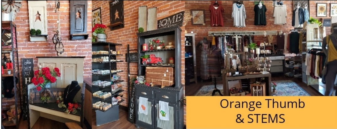
Orange Thumb & STEMS