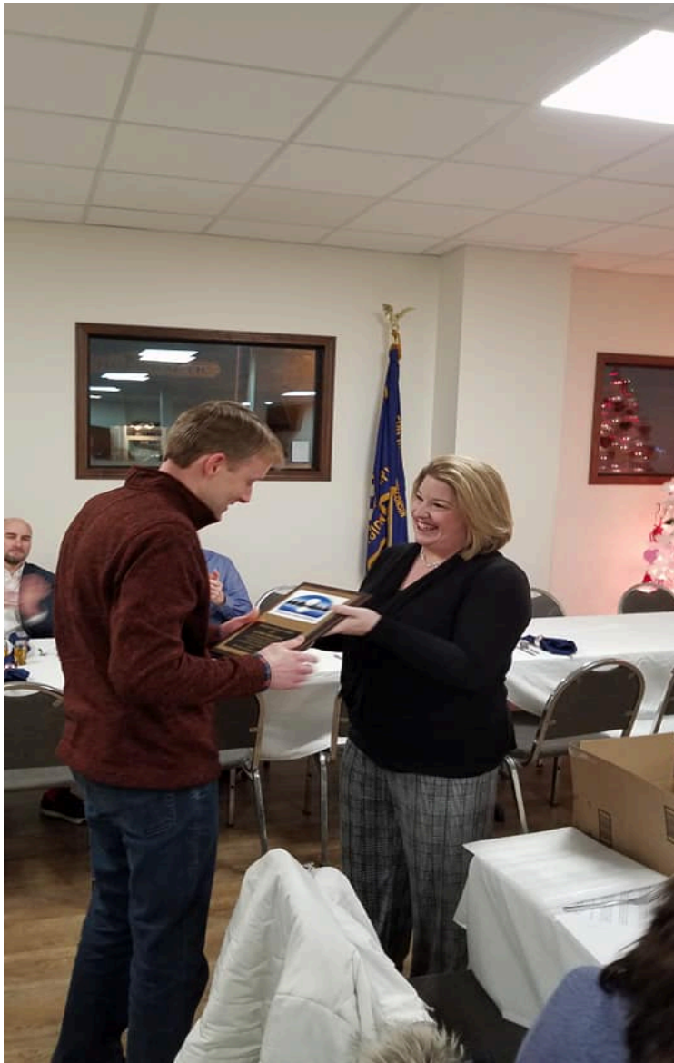
Business of the Year LeCoulee Cheese Castle