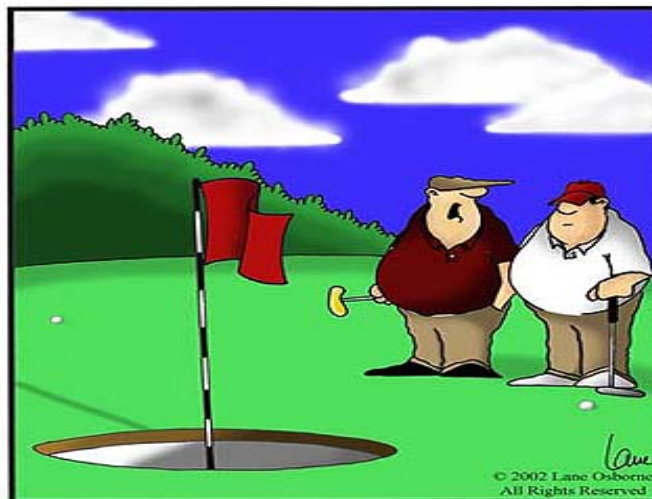
"I don't know what it is about it, but I love this course!"

Come out to this fun event and enjoy some camaraderie!